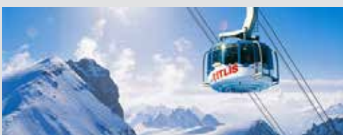
CABLE CAR MOUNT TITLIS