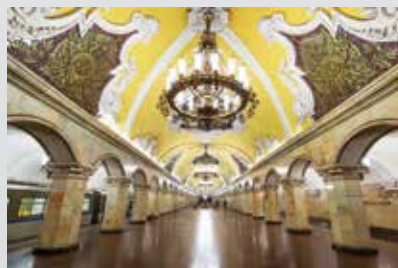
Underground Metro, Moscow

For more information, please call our hotline (03) 2148 3880