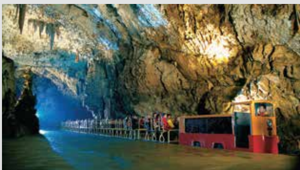
Postojna Cave, Slovenia