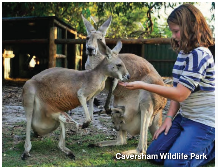
Caversham Wildlife Park