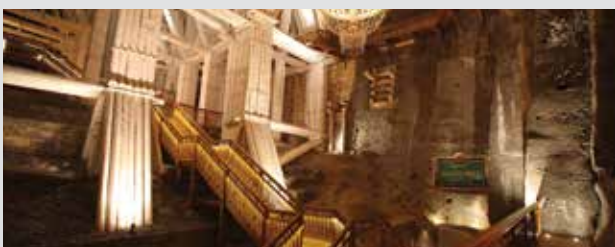
Wieliczka Salt Mine, Krakow