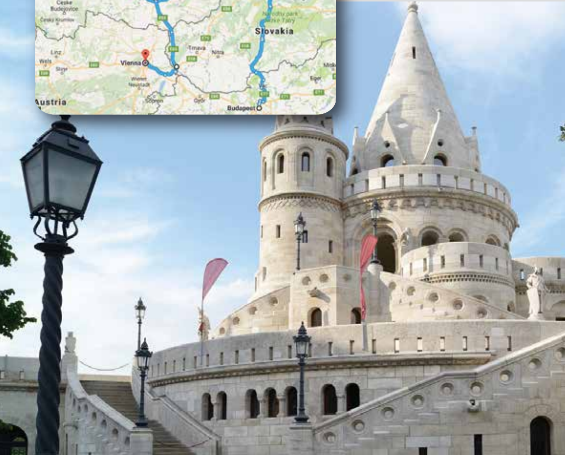
Fisherman Bastion, Budapest